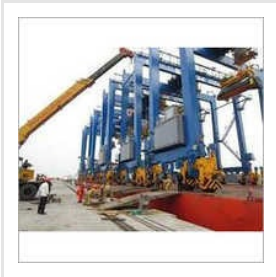
RTGS Work On Berth