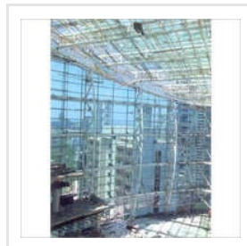
Glass Panel Work