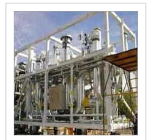
Plant Erection Services