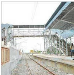
RAILWAY BRIDGE AND TOWER STRUCTURES FABRICATION SERVICE

Braced Girders Erection Service, Bridge Erection Service, Bridge Structural Fabrication Service, Cantilever Service, Concrete Core Cutting Service, Core Cutting Service, Dismantling And Erection Services, Electrical Erection Services, Erection Services, Gantry Erection Services, Glass Facade Fabrication Service, Glass Panel Work, Heavy Equipment Erection Services, Heavy Structural Work, High Rise And Heavy Structure Work, etc.