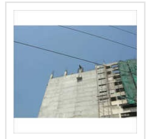
High Rise And Heavy Structure Work