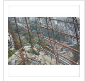
Glass Facade Fabrication Service