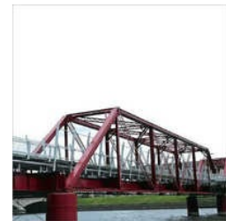
BRIDGE STRUCTURAL FABRICATION SERVICE