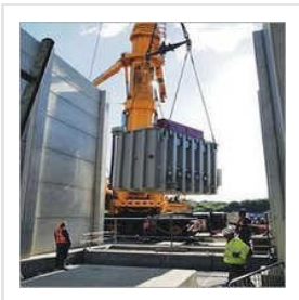
Electrical Erection Services