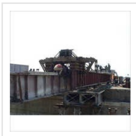
Bridge Erection Service