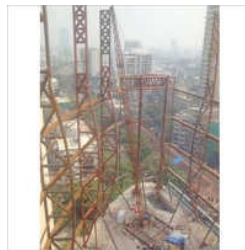
TOWERS LONGER SPAN FABRICATION SERVICE