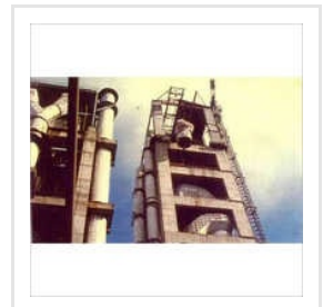
Dismantling And Erection Services