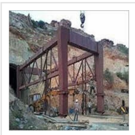
Gantry Erection Services