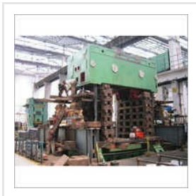
Heavy Equipment Erection Services