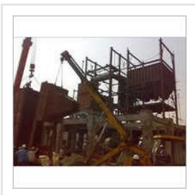
Industrial Erection Services